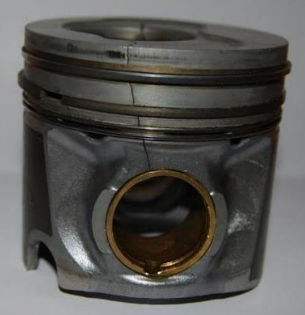
Fig. 1. 2. A crack on the piston pin: a) cracked piston head; b) cracked piston skirt