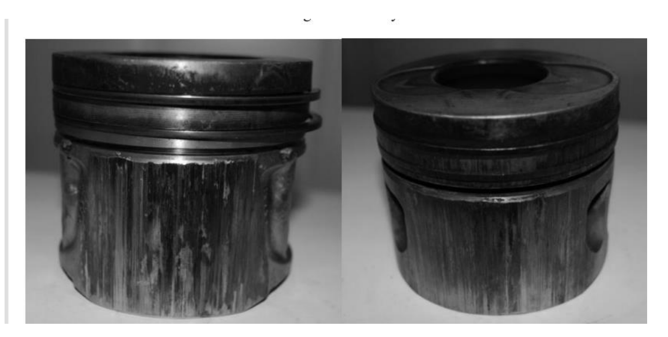
Fig.1.1. A piston skirt seizure

to high thermal loads especially on pistons. Therefore, piston cooling has been one of the determining factors in the construction of an efficient engine and accurate prediction of piston temperature is also important.