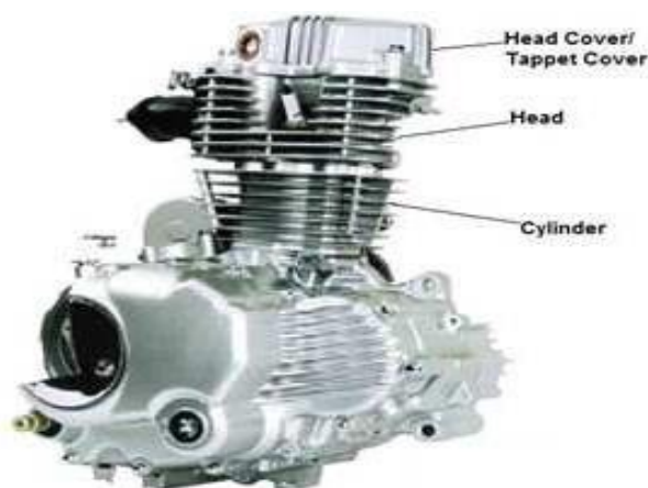
Fig.1 Engine Head

The vitality move from the consuming office of an (IC) start Engines are scatter in three particular habits that. as for 5 percent(%) the fuel essentialness is recoup into significant shaft work or basically mechanical work and concerning percent(%) imperativeness is removed to the vapor. concerning third of the whole warmth created all through the consuming methodology ought to be transmitted from the start chamber through the chamber dividers and plate to the air.