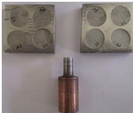
Fig. 1 Machined work piece and Tool