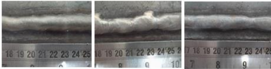
Fig. 2. Hard faced layer (a) Sample-1 (b) Sample-2 (c) Sample-3

These experiments were planned to study the effect of carbon percentage in the developed hard faced layer. Figure 2 shows the three different hard face layer with different carbon percentage.