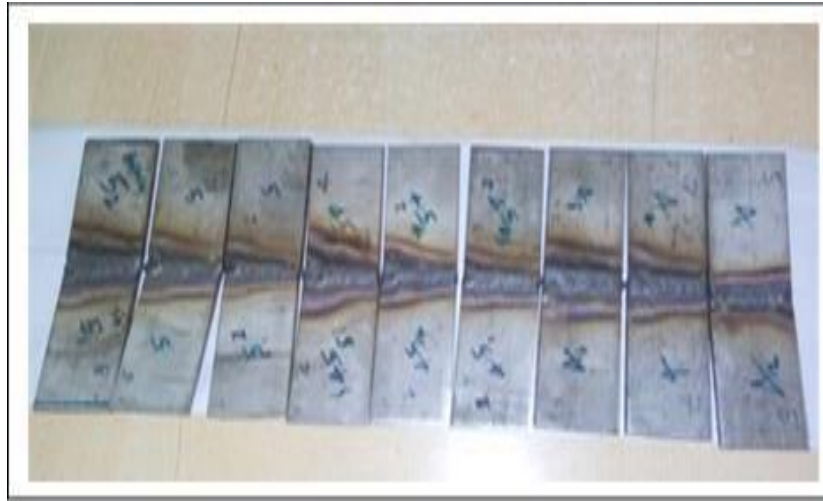
Figure 1 Welded specimen