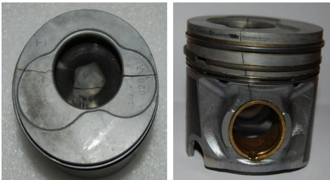
Fig. 1. 2. A crack on the piston pin: a) cracked piston head; b) cracked piston skirt

The manufacturing of cylinders includes boring, honing and plateau honing which has received much attention by manufacturers in recent times. The process of the surface changes which occurs during running of the engine is related to the wearing action caused by the piston ring on the bore. This action takes place of —transitional topographyl where the surface generated exhibits the influence of the piston ring which modifies the machined surface.