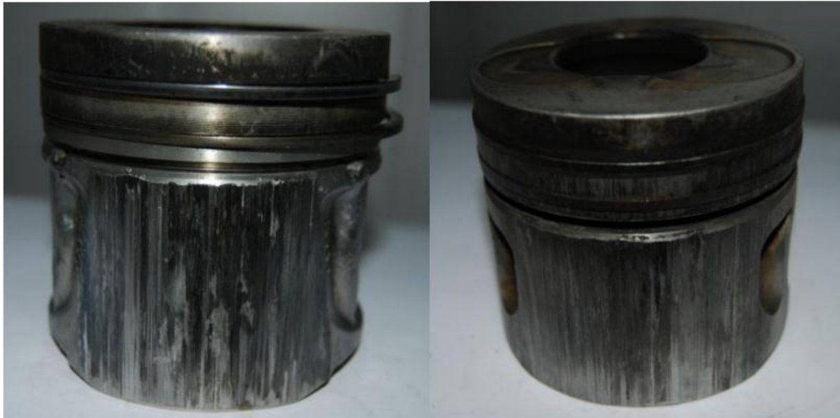
Fig.1.1. A piston skirt seizure

means that diesel engines are Eco-friendly and have greater potential in future emissions laws due to their low carbon dioxide (CO 2 ) emissions. On the other hand, diesel engines have difficulty lowering nitrogen oxide (NO x ) and particle particles (PM), and higher power requirements and lower fuel consumption remain diesel engines installed in commercial vehicles, such as trucks and buses. To meet these requirements, current diesel engines are required to increase high turbo charging, high pressure manifold and to improve airflow in the piston firebox. These materials lead to high thermal loads especially on pistons. Therefore, piston cooling has been one of the determining factors in the construction of an efficient engine and accurate prediction of piston temperature is also important.